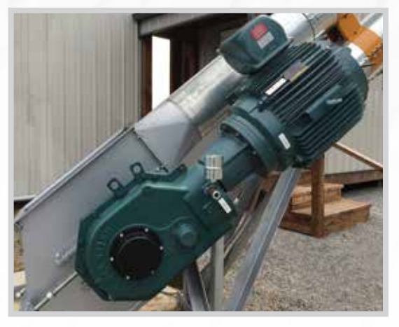
LOW MAINTENANCE DIRECT DRIVE