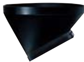
30° Drop Boot