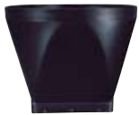
Straight Drop Boot

Multiple outlet requirements can be easily handled by our 22" (559mm) all metal boot. This boot, which can be fitted to any GSI grain hopper tank, will allow installation of up to four feed lines in several directions at once. GSI's 16" (406mm) parabolic boot (available in straight drop or 30° models) is made from the very latest in ultra high impact polypropylene for greater flexibility, dependability and durability.