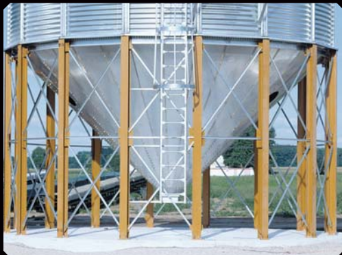
45 DEGREE HOPPER SLOPE

An optional, roller valve assembly is available designed to attach directly to the hopper discharge collar. Roller valve gates are equipped with machined rack and pinion gear sets controlled by either a hand or chain wheel. All galvanized construction, the GSI roller valve is simple to operate and provides years of trouble free service.