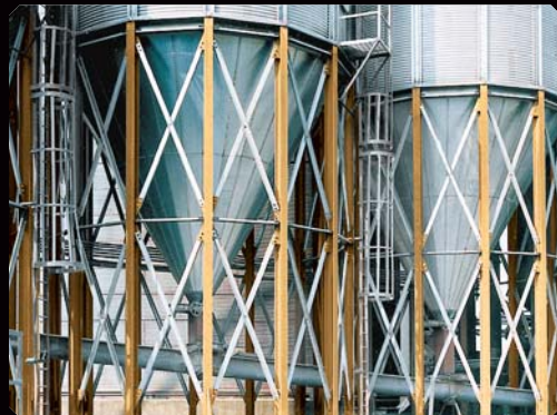
60 DEGREE HOPPER SLOPE