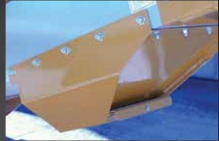
Cleanout door at inlet for easy cleaning.