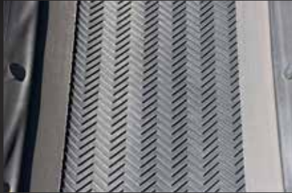
The 15" wide chevron-top belt moves grain through 12" tube.

GSI Field Load Conveyors are available in 3 different models - lengths of 35', 40' and 45' - with capacities up to 6,000 BPH. Field Load Conveyors can be used for unloading a bin or emptying a truck. Electric or hydraulic drive options are available.