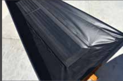
Collapsible hopper standard.