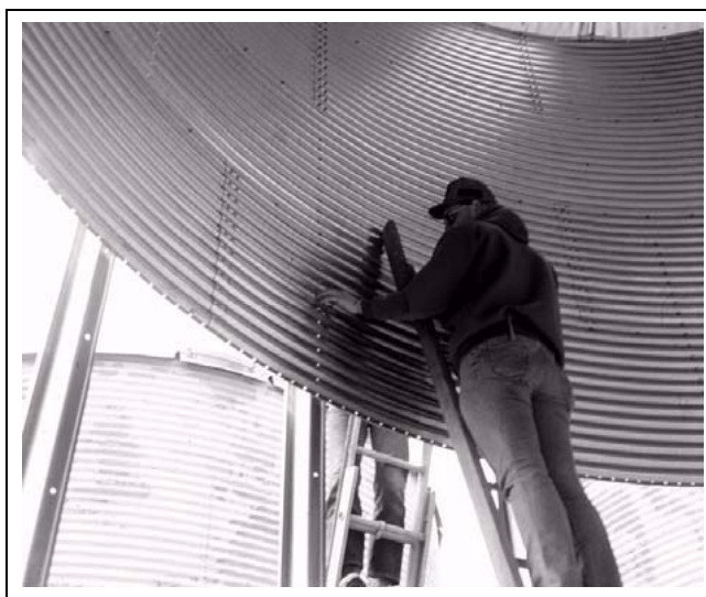
Figure 3 Installing legs to bin with bolt heads on the inside of bin and nuts on the outside.