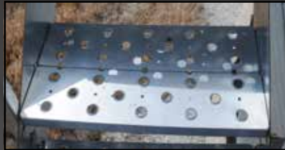
New, 2-piece step design gives you the strength of two steps in one