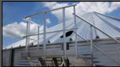
Low – single or double platform, located just below the eave